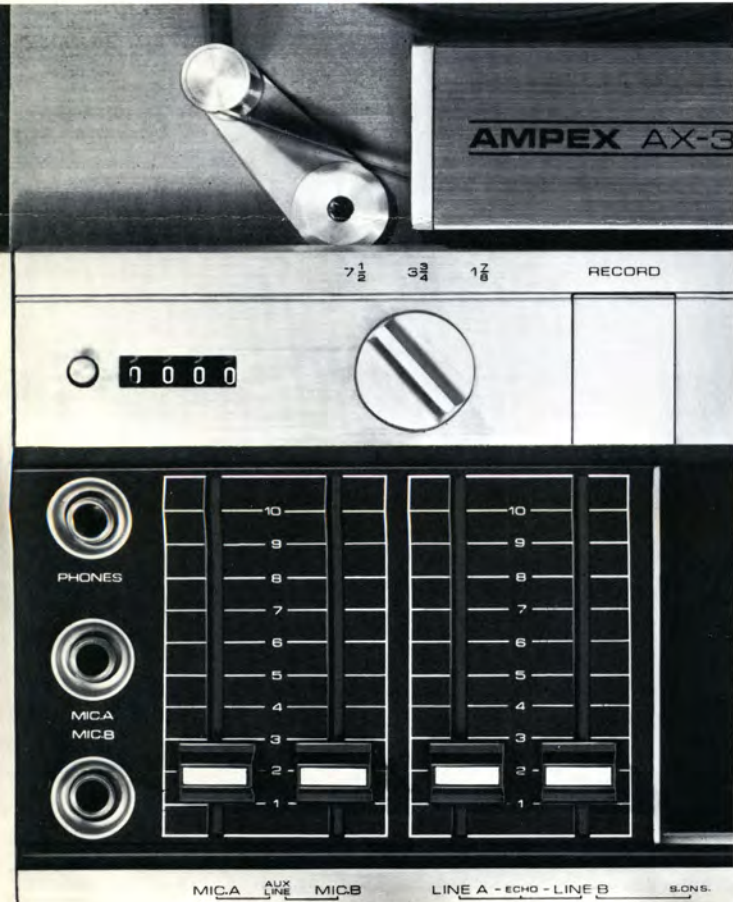
Fingertip function control center.