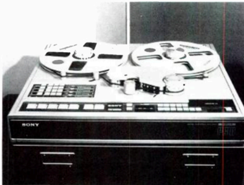
Figure 11. The Sony PCM-3204 four-channel digital tape recorder.