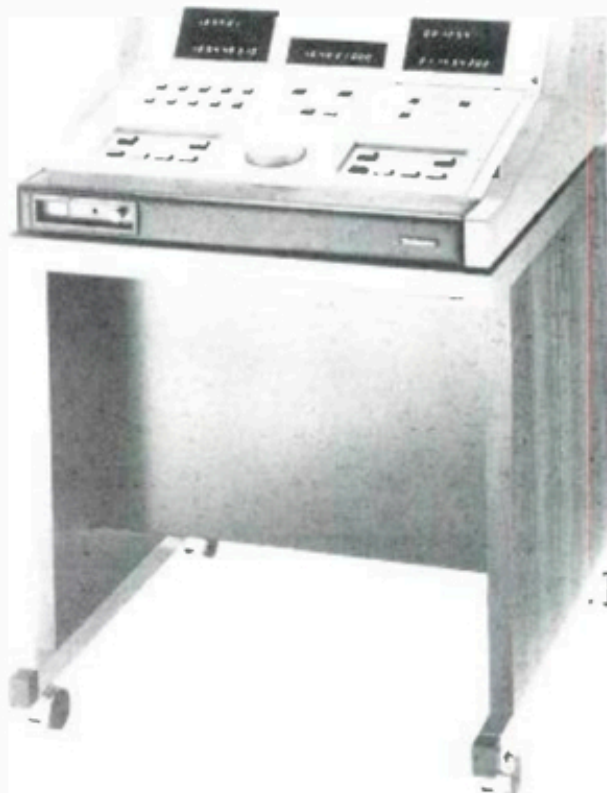
Figure 3. Technics Editing Controller.