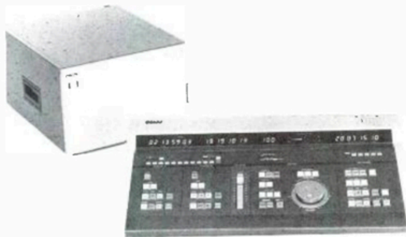
Figure 4. Sony DAE-1100 Digital Editor.