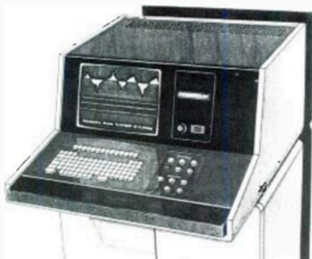
Figure 1. An artist's conception of an early 3M editing system. When pre-production prototypes were judged overly complex for routine editing chores, the system seen in Figure 2 was developed.