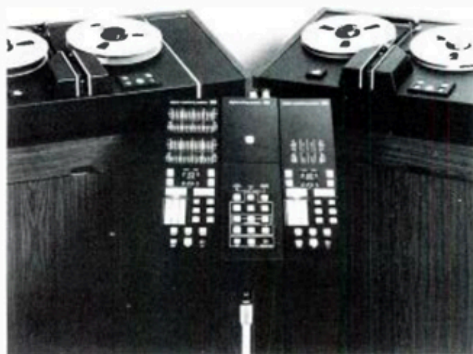
Figure 2. The current 3M digital editing system was described in the February, 1980 issue of db.