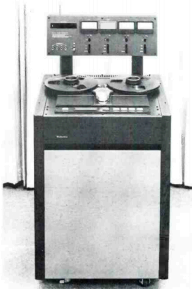
Figure 8. An experimental four-channel recorder from Technics.