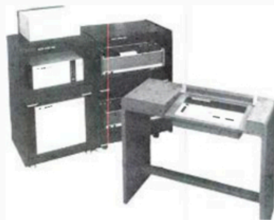
Figure 5. JVC Series 90 Digital Audio Mastering System, incorporating video tape recorders.