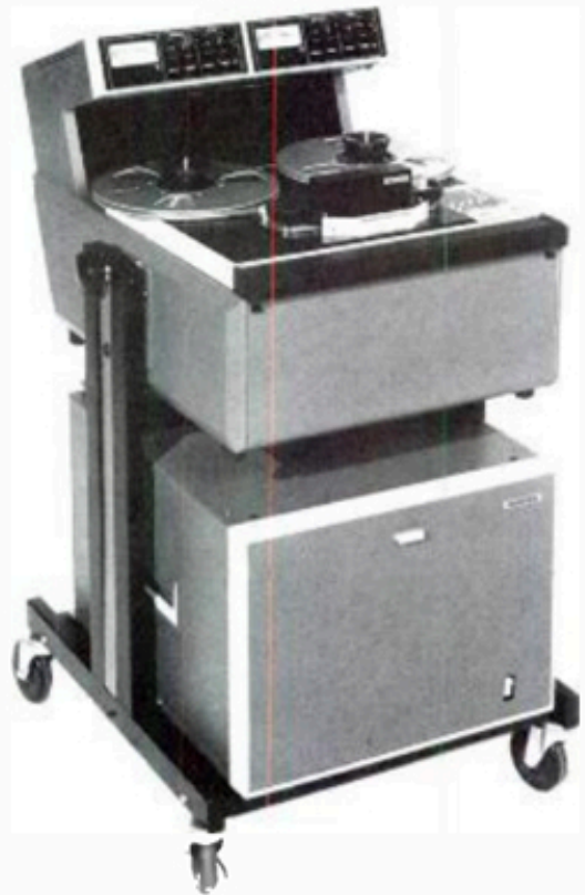
Figure 10. An Ampex digital prototype, offering four channels on quarter-inch tape (50 kHz sampling rate). A series of experimental sessions are planned for later this year.