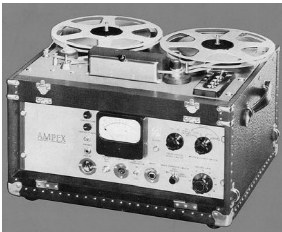
Fig. 7. Model 400A portable.