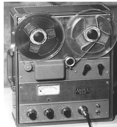
Fig. 8. Model 600.

The same year, Jack Wernli started development of the Model 600 series of products that was eventually introduced in 1954. The 600 used 7-inch reels. It was both portable and light weight at only 27 pounds. At 7.5 ips, its recording/playback quality equaled that of the Model 400.