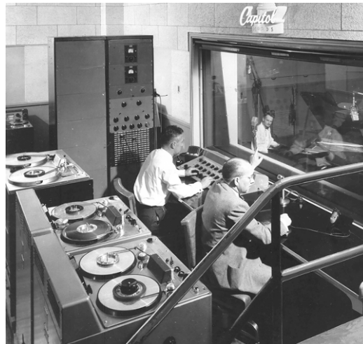
Fig. 6. Models 201 and 300 in use at Capitol Records.

By early 1949, the financial situation for Ampex had improved considerably as a result of shipments of the Model 200A and Model 201 conversion kits. Alex was now able to do something he had wanted to do for some time: hire Walter Selsted.