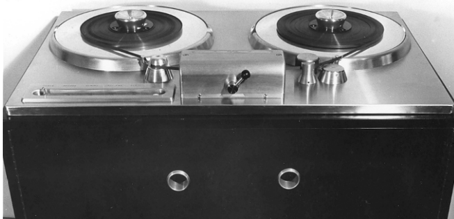
Fig. 4. Model 200A.

Ampex delivered the first production Model 200A in April, 1948, to Jack Mullin; the second recorder followed a few days later. Jack used serial numbers 1 and 2 for recording the Bing Crosby Show. Many of the rest of the first production run of 20 went to ABC in Chicago where they were used mainly for broadcast time delay. This was a revolutionary change for the