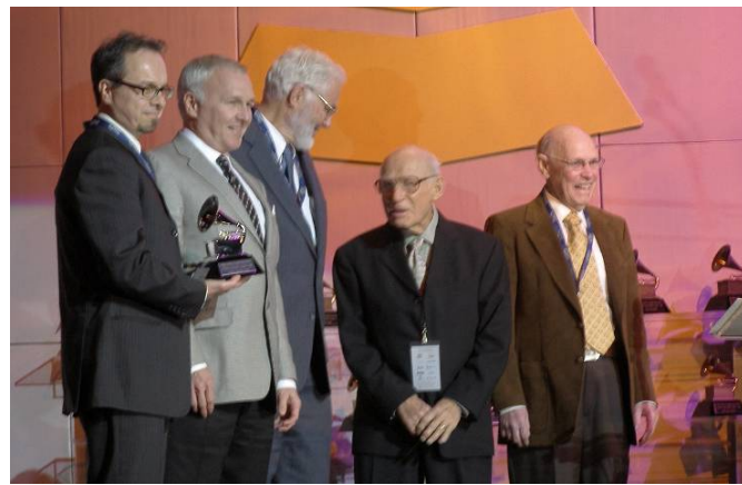
Fig. 13. Grammy award ceremony, 2008 February 9.