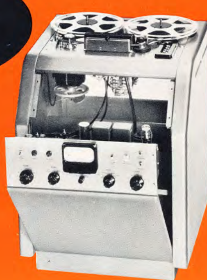
FRONT PANEL GLIDES OUT

... hinged electronic assembly makes inspection of components easy.